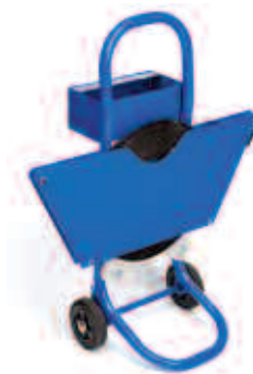
RIBBON WOUND TROLLEY Part No. SF1320