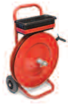
OSCILL. TROLLEY Part No. SF1321