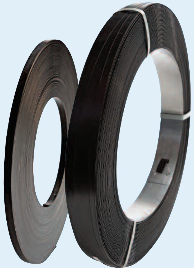
RIBBON WOUND STEEL