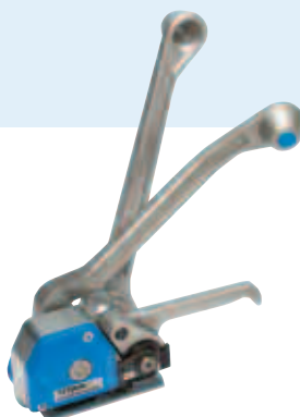
HEAVY DUTY SEALLESS TOOL Part No. SF1306