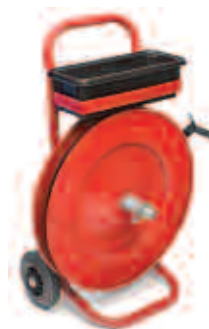
OSCILL. TROLLEY Part No. SF1321