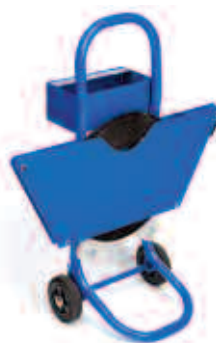
RIBBON WOUND TROLLEY Part No. SF1320