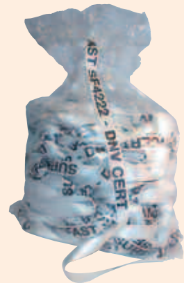
38mm LASHING Part No. SF4222