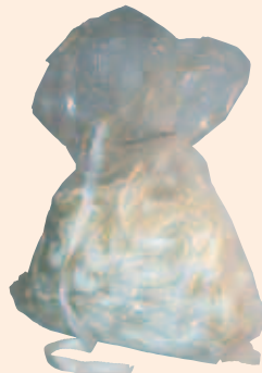
25mm LASHING Part No. SF4220