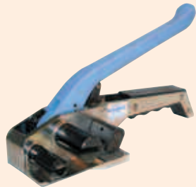
GIANT SWISS TENSIONER Part No. 1410 (Up to 40mm wide strap)