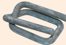
38mm BUCKLE Part No. 4916