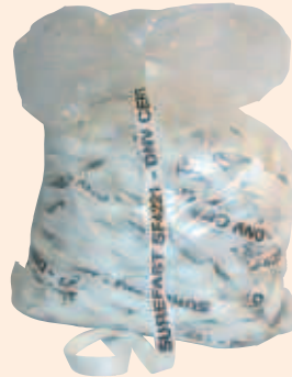
32mm LASHING Part No. SF4221