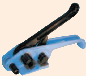
SWISS TENSIONER Part No. SF1401 (Up to 25mm wide strap)