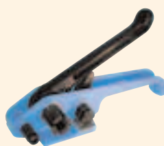
SWISS TENSIONER Part No. SF1401 (Up to 25mm wide strap)