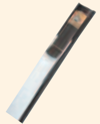
PALLET STRAP FEEDER Part No. SF1431