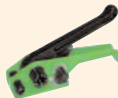
STANDARD TENSIONER Part No. SF1402 (Up to 19mm wide strap)