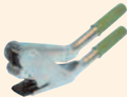
STEEL SAFETY CUTTER Part No. SF1430