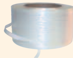
COMBISTRAP Part No. SF4402/06/12/14/16/20 Various sizes available 13mm, 16mm, 19mm, 25mm and 32mm