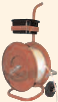
DISPENSING TROLLEY Part No. SF1445