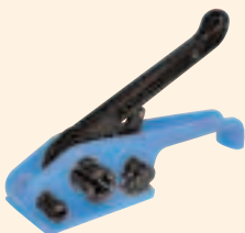
SWISS TENSIONER Part No. SF1400 (Up to 19mm wide strap)