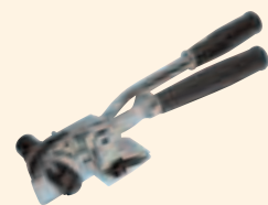
ROUND BUNDLE TENSIONER Part No. SF1250 (Up to 19mm wide strap)